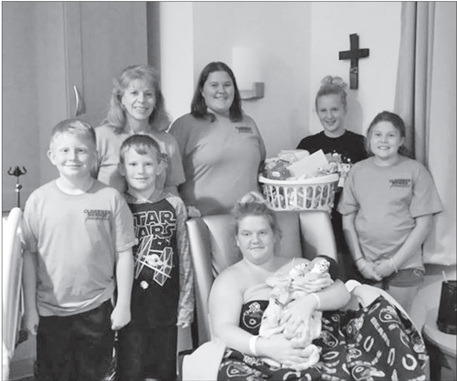
Clarence Bridge Pioneers 4-H Club presented a basket of goodies to the first baby born during 4-H week, Oct. 1 to Oct. 7, 2017.

The next meeting is Sunday, Nov. 12 at Spring Grove Town Hall. We hope to see you there.