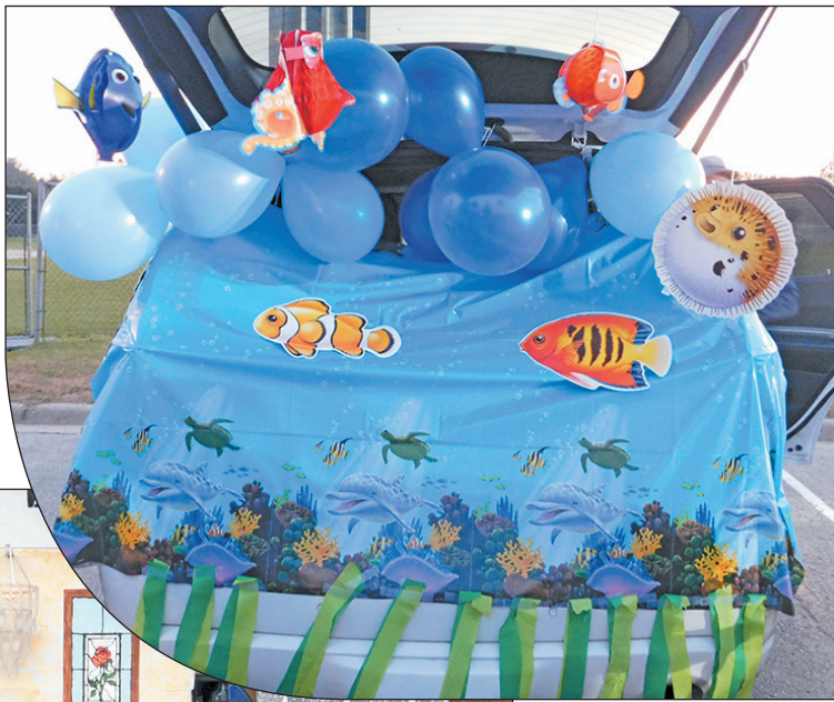
(Right) The younger participants enjoyed this Finding Nemo theme.