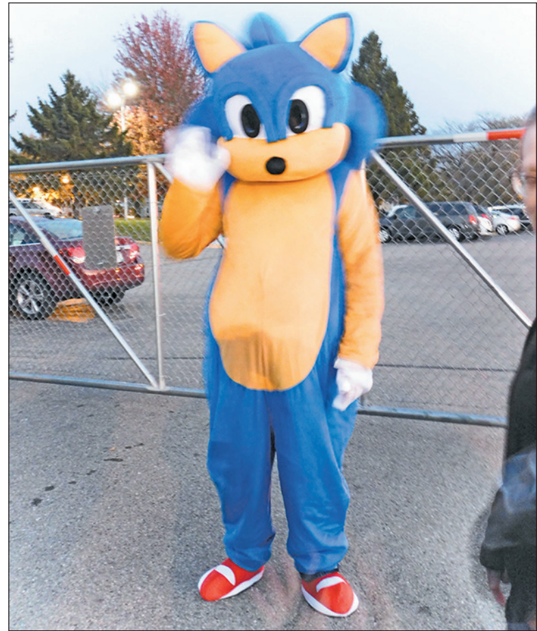
A blast from the past, Sonic the Hedgehog greeted all of the children with a wave.