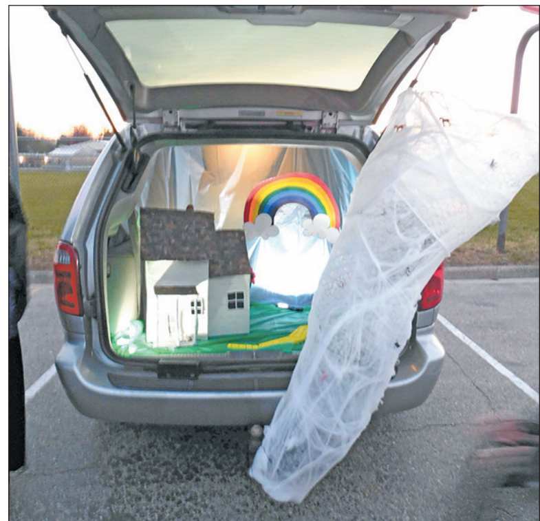
The Wizard of Oz made an appearance for the trick or treaters.

One volunteer was eagerly attempting to get more candy and said the crowd was the biggest she's seen. She also stated that last year she went home with candy leftover and wasn't expecting to be picked clean so early.