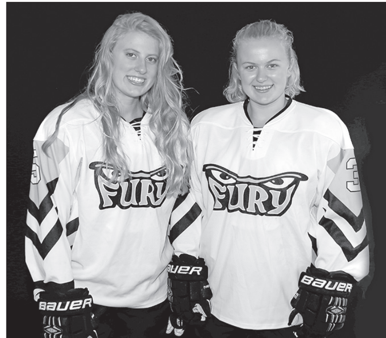
SUBMITTED/FRANK K PHOTOGRAPHY PHOTO Brodhead Independent-Register

Additional details on the locations of Disaster Recovery Centers and the loan application process can be obtained by calling the SBA Customer Service Center at 800-659-2955 (800-877-8339 for the deaf and hard-of-hearing) or by sending an e-mail to disastercustomerservice@sba.gov.