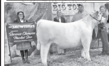
2018 Reserve Grand Champion Steer Shorthorn Junior Nationals

Saturday, Oct. 12, 2019 • 7:30 PM Stephenson Co. Fairgrounds • Freeport, IL Cattle ready for viewing at 5:30 PM