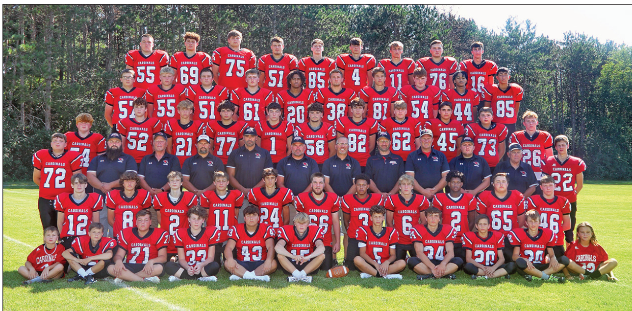
Brodhead-Juda football team.