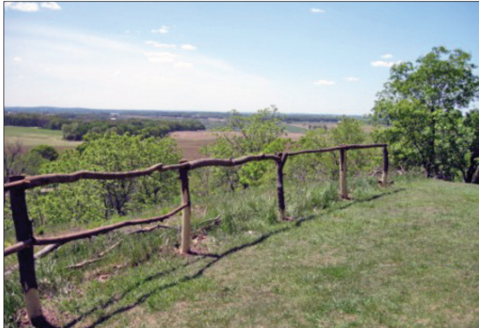
ROCK COUNTY PARKS PHOTO Brodhead Independent Register Magnolia Bluff Rock County Park is about 5 miles north of Brodhead, 18 miles west of Janesville. The 120-acre park is 1/2 mile south of the State Hwy 59 and Croak Road intersection, on Croak Road, near the Green-Rock county line and State Highway 104. It features beautiful rock outcroppings, vistas, and two trails - a bridle and nature trail and a cross-country ski and hiking trail.

frightening. They happen when adults are willing to talk honestly about things that are hard to understand, scary, embarrassing or painful. When adults are willing to have these types of conversations with children, the result is that children feel reassured that they are not alone in their struggles and they are better able to find meaning or purpose in their struggles. Positive Childhood Experiences also include opportunities to engage in meaningful learning and growth experiences. Contact Bridget Mouchon at the Green County Extension office 608 328-9440 for more information or to register. Or check out the Green County Healthy Community Coalition Facebook page for the sign-up link: www.facebook.com/GCHealthyCommunityCoalition .