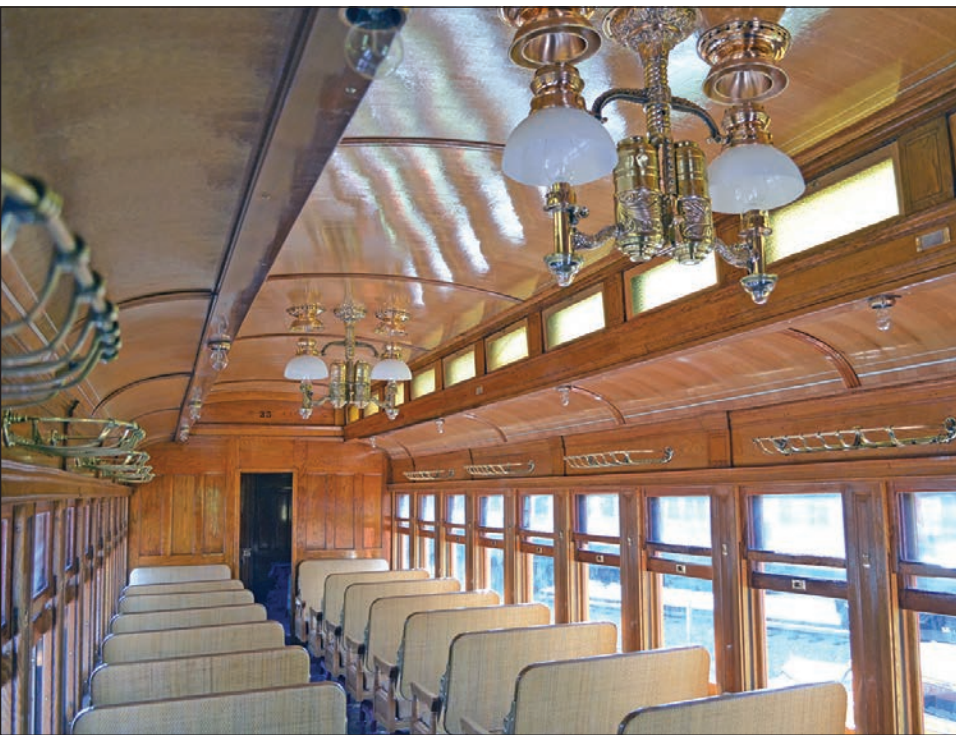
Restored interior of the Copper Range Railroad #25 coach-baggage car at the rail car museum in North Freedom, about 80 miles north of Brodhead and Madison via Highway 12, near Wisconsin Dells.