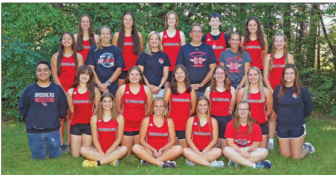
Brodhead-Juda girls cross country team.