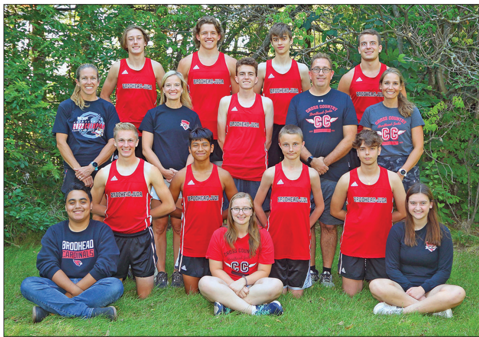
Brodhead-Juda boys cross country team.

Expires 11/29/22. COUPON MUST BE USED AT TIME OF PURCHASE. Serving the area for over 30 years