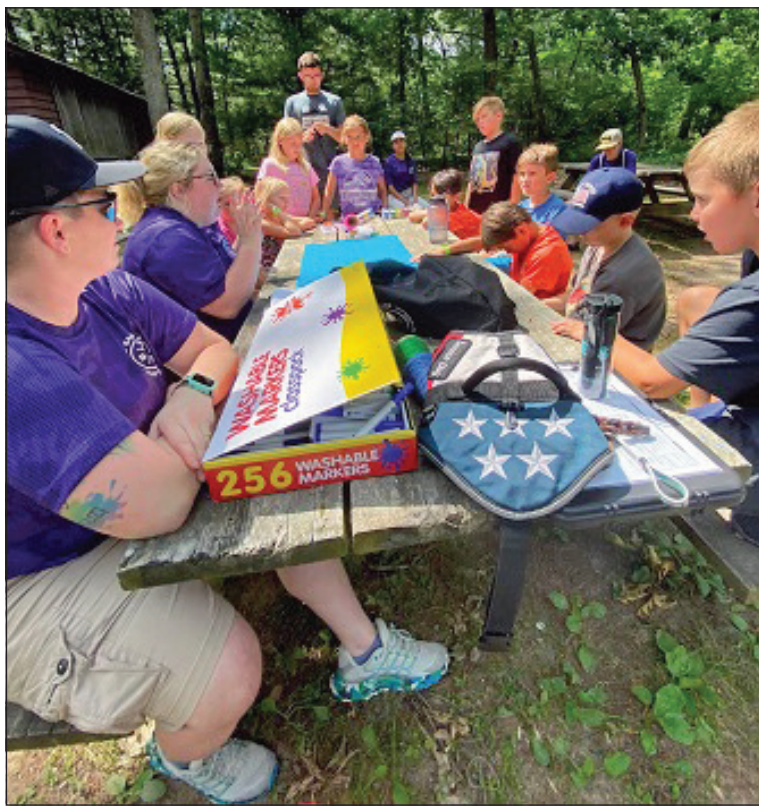
Wisconsin National Guard Child and Youth Program staff helped Wisconsin’s military youth create a guidon during Badger Youth Camp at Camp Lakotah in Wautoma, Wis., July 7.

The members of the panel network with military youth from other states and also serve as an advisory board to the child and youth program to let them know where