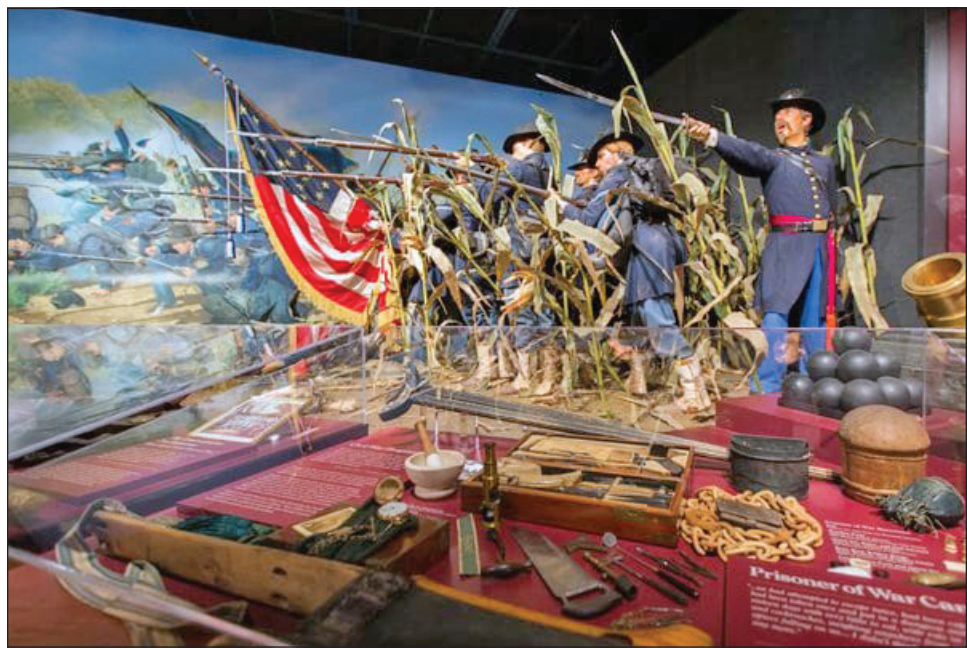
Brodhead Independent Register An Antietam Civil War diorama is just one of the stirring exhibits visitors can see at Wisconsin Veterans Museum, 30 W. Mifflin St., in Madison. Visiting this week can make Veterans Day observance especially meaningful.

the Center for War and Society and the USS Midway Chair in Modern U.S. Military History.