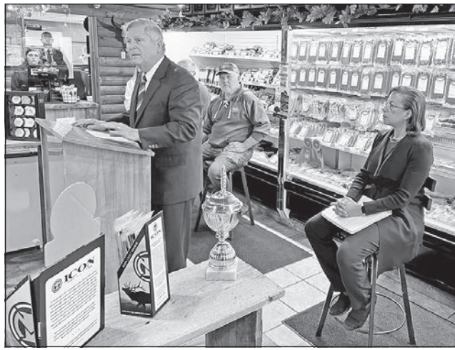
DANIELLE ENDVICK WFU PHOTO Brodhead Independent-Register

"If farmers have more markets, then they'll have greater competition for what they're growing and raising and get a fairer price," Vilsack stressed. "If you create more processing,