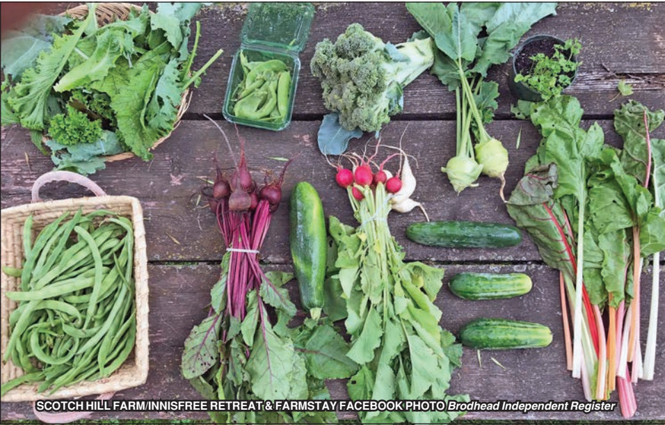
SCOTCH HILL FARM/INNISFREE RETREAT & FARMSTAY FACEBOOK PHOTO Brodhead Independent Register