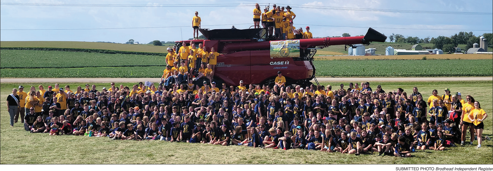
The Brodhead and Parkview Food For America Event: all of the 446 fourth graders from Albany, Brodhead, Durand, Juda, Monroe Elementary, New Glarus and St. Victors attended, along with all of the Brodhead High School students (pictured here) that helped with the event.