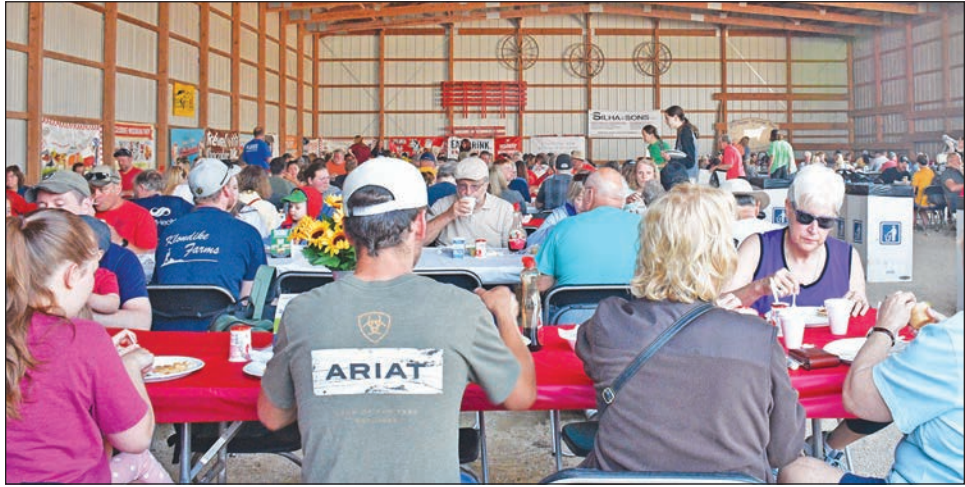
Above and left: The annual Dairy Breakfast event is very popular in each county and Rock County does their own proud. The first dairy breakfast for Rock County took place back in 1977 on the Roger Rebout Farm in Janesville, and since then many area farms have hosted, as well. The breakfast was delicious, fun for everyone and very well organized with the help of many volunteers.