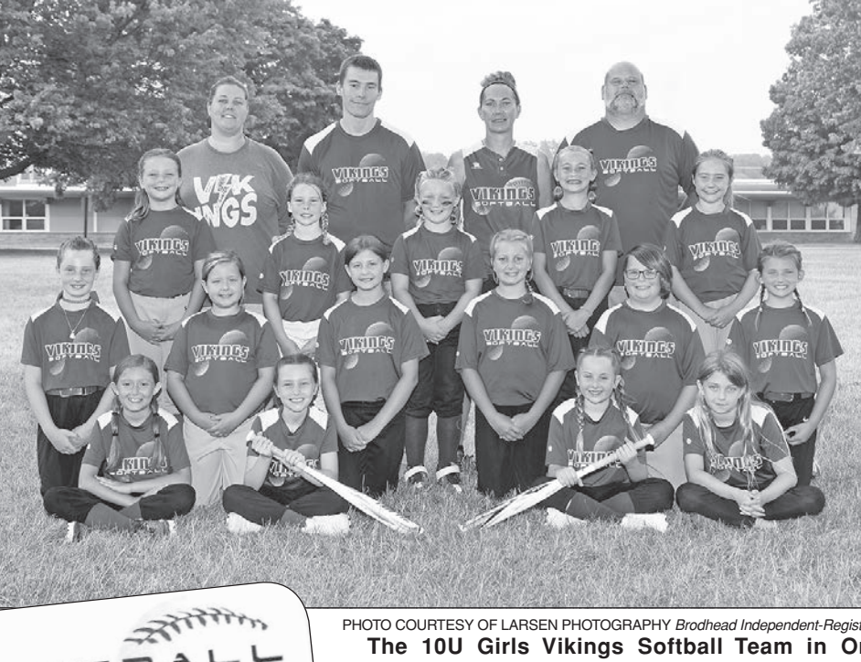
Brodhead Independent-Register The 10U Girls Vikings Softball Team in Or-

Huebner. Missing: Max Wellnitz, Case Harnack.