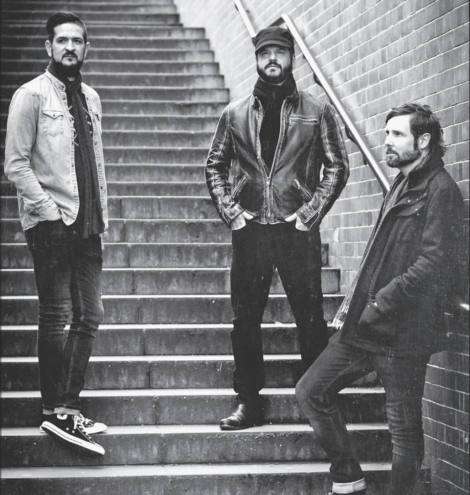
The Record Company -Aug. 19

For more information, contact the zoo's Marketing and Communications Division at 414.256.5466 or visit milwaukeezoo.org/visit/upcoming-events.