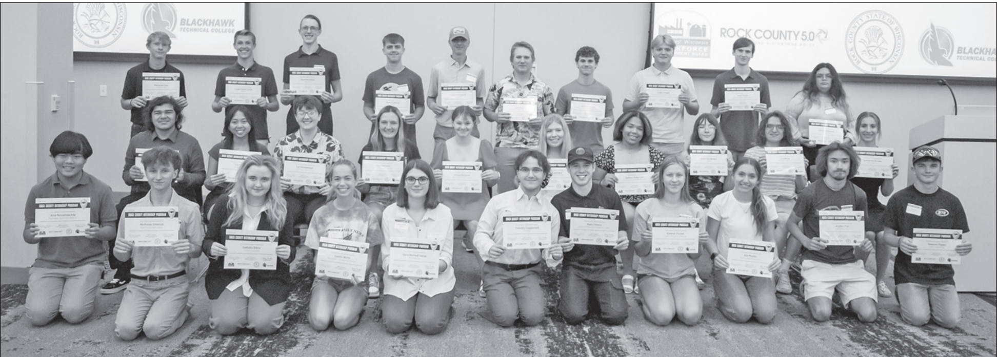
32 area high school students graduated on July 28 from the 2023 Summer Rock County Internship Program, including five students from Clinton. This is

POST PAID U.S. POSTAGE Independent- Register Customer