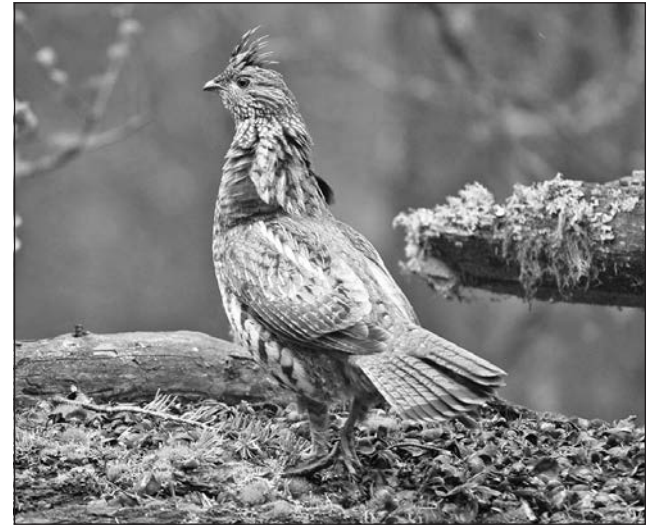
ISTOCK.COM/R_KOOPMANS PHOTO Brodhead Independent Register

For Game Bird Brood Observations, the DNR needs to know the bird species (turkey, ruffed grouse or pheasant), the type (adult or poult) and the number observed of each type. This information is a basis for monitoring the reproduction of game birds for that breeding year. More information is available on the Game Bird Brood Observations webpage at dnr.wisconsin.gov/topic/WildlifeHabitat/GameBirdBroodObservations .