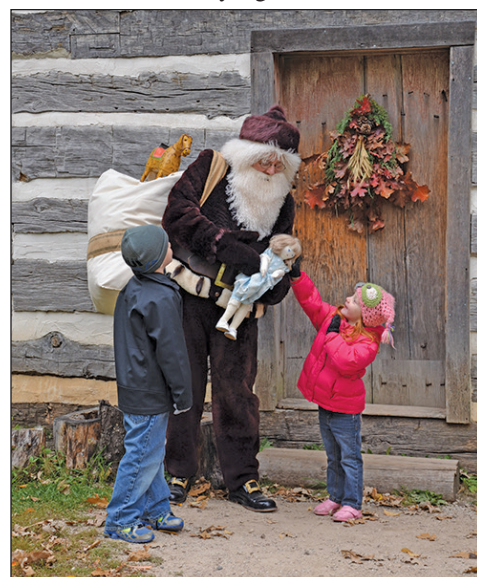
St. Nicholas greets children at Old World Wisconsin in 2016.