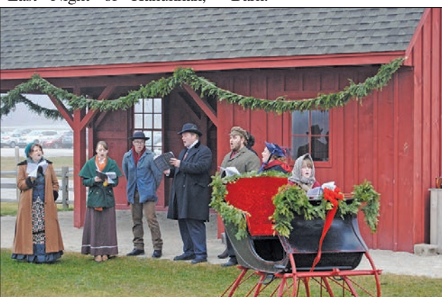
Carolers sing at Old World Wisconsin in 2015.