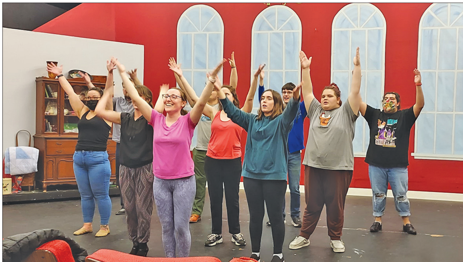
The actors rehearse one of their many dance numbers for Irving Berlin's Holiday Inn. The musical will be on the Colony Brands stage in Monroe this December.

Monroe Theatre Guild's presentation of Holiday Inn, part of the Colony Brands performance series, is the final installment of their 2023 season. With 53 years of community theatre to their credit, having started the tradition in 1970, MTG is preparing to announce their much-anticipated 2024 Season to their members and the public later this month. Performances at Monroe