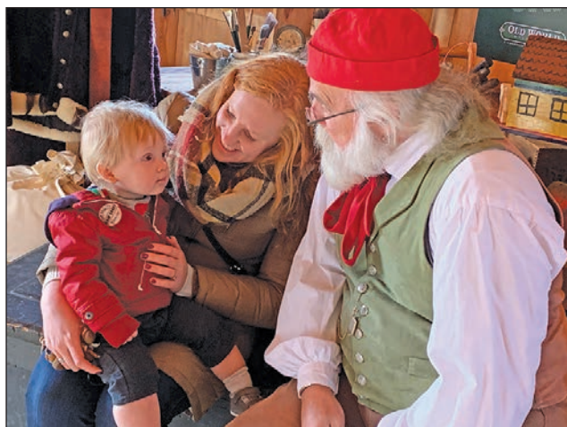
In 2019, Santa greets a child in Old World Wisconsin. Visitors can stop by Santa's workshop this year for a family photo with St. Nicholas.

Holiday shopping abounds from historic token gifts in the Blacksmith Shop and General Store to a bounty of holiday merchandise found in the Creamery and the Ramsey Barn.