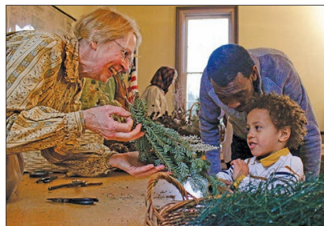
Step inside the Cheer House to make a holiday greenery decoration.