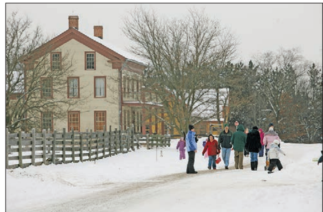
Guests strolled through the village in 2021. This year, guest can watch reenactments of an "Irish Christmas Eve" in the village at Old World Wisconsin.