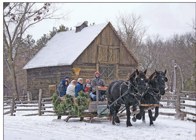
Guests take a sleigh ride in a horse-drawn wagon at Old World Wisconsin in 2013.

The Wisconsin Historical Society, founded in 1846, ranks as one of the largest, most active, and most diversified state historical societies in the nation. As both a state agency and a private membership organization, its mission is to help people connect to the past by collecting, and sharing stories. The Wisconsin Historical Society serves millions of people every year through a wide range of sites, programs, and services. For more information, visit www.wisconsinhistory.org .