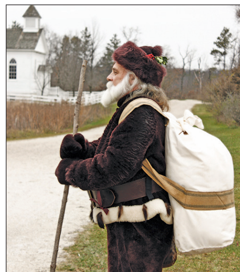
In 2016, holiday traditions were celebrated at Old World Wisconsin in Eagle, Wis.