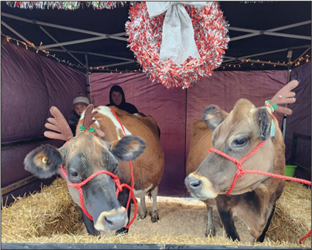
Wisconsin "reindeer" provided by New Glarus 4-H Dairy will be on display in New Glarus at the Christkindli Market.