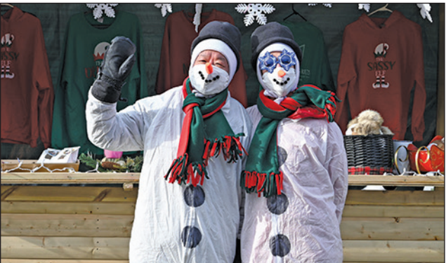
Attendees at the New Glarus market dressed as snowman to celebrate the season.