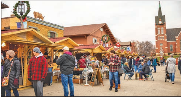
An outdoor Christmas market will host 30 vendors offering a variety of high quality, locally made and sourced holiday gifts, decorations, and foods, all housed in wooden on-street chalets in downtown New Glarus.