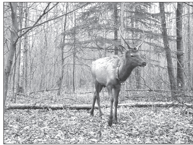
PHOTO COURTESY SNAPSHOT WISCONSIN, WISCONSIN DNR Brodhead Independent-Register

The 2024 elk hunt application period for Wisconsin residents is expected to open March 1 and run through May 31, 2024. For more information on elk in Wisconsin, visit the DNR's Elk webpage.