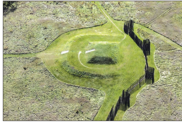
Brodhead Independent-Register