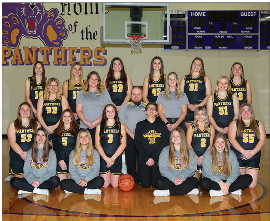
The 2023-2024 girls basketball team for Juda.