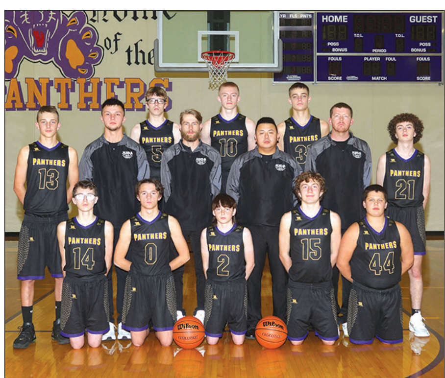
The 2023-2024 junior varsity boys basketball team for Juda.