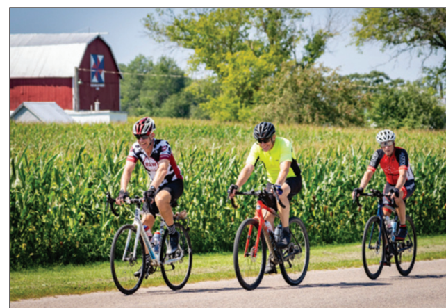
The ninth Ride Across Wisconsin will be Aug. 17 to 18. Registration opened in January.

cessible across the state – particularly in the state's most populous urban communities of Milwaukee and Madison.