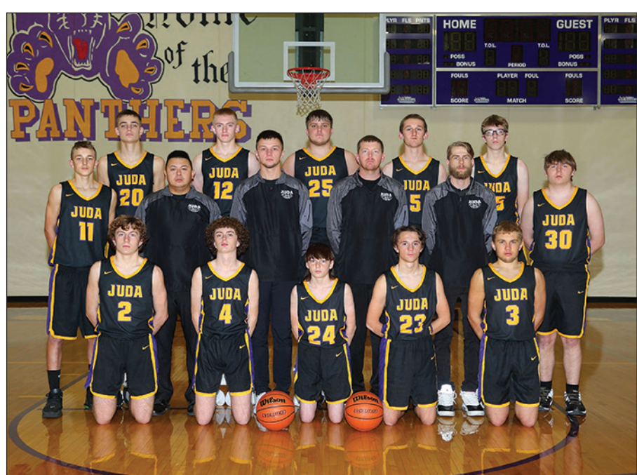
The 2023-2024 varsity boys basketball team for Juda.