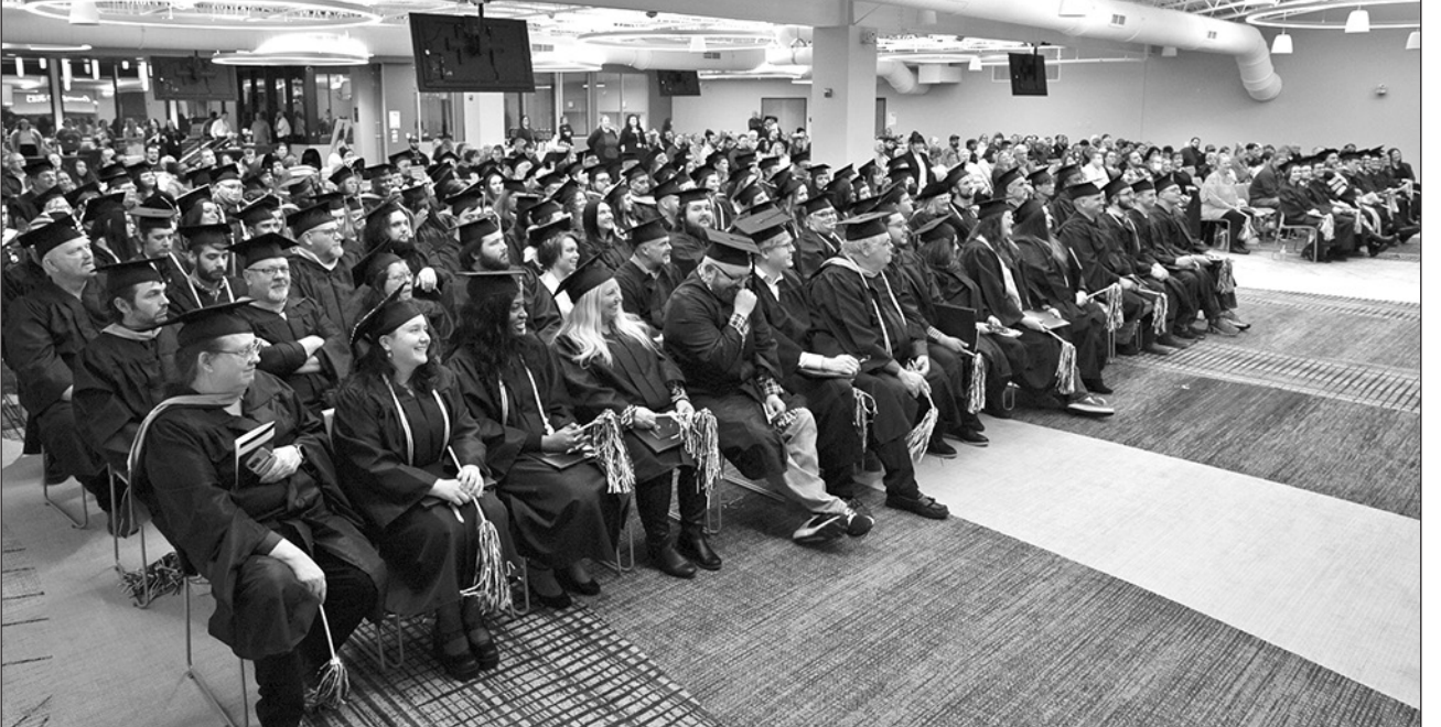
Many students earned their degrees in December from Blackhawk Technical College, with 49 of the graduating students participating in the college's December Commencement ceremony held on Tuesday, Dec. 19, 2023.