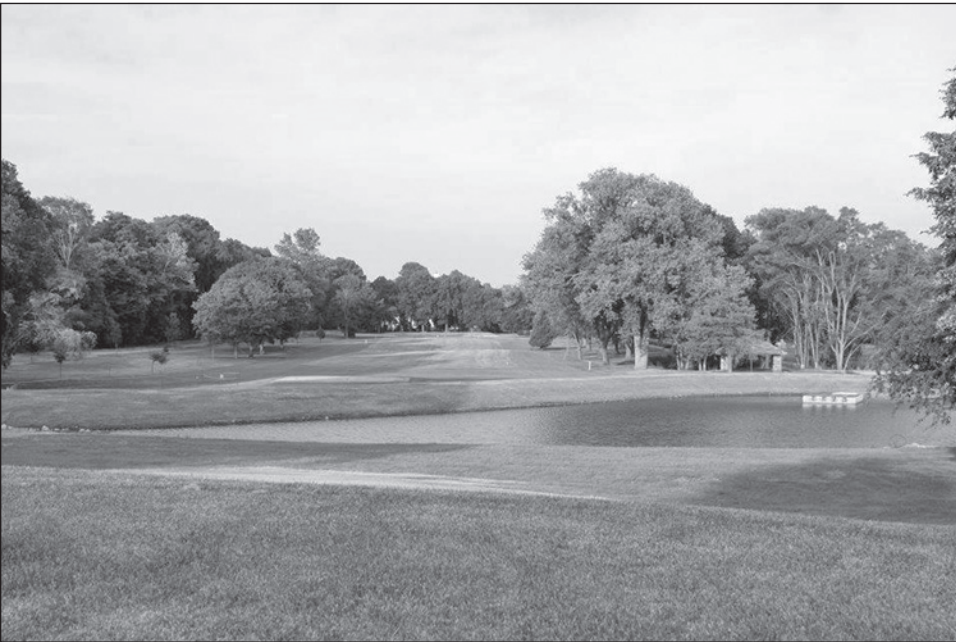
Hitting the Links

Hospitality, great customer service and affordability make Krueger-Haskell Golf Course the ideal place to play golf.