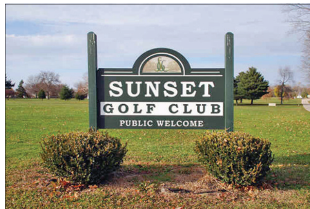
SUBMITTED PHOTO Hittin' the Links

Range Annual: $100 per person Small: $3.50 Large: $5