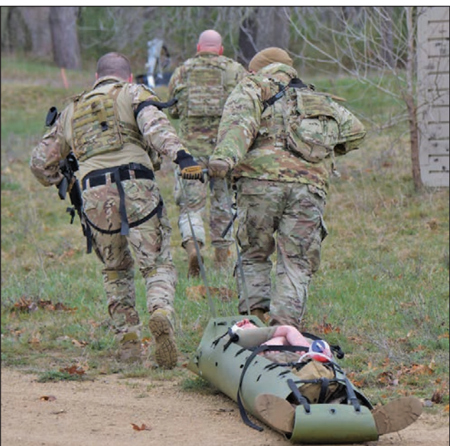
Airmen practice their evacuation skills on April 18.