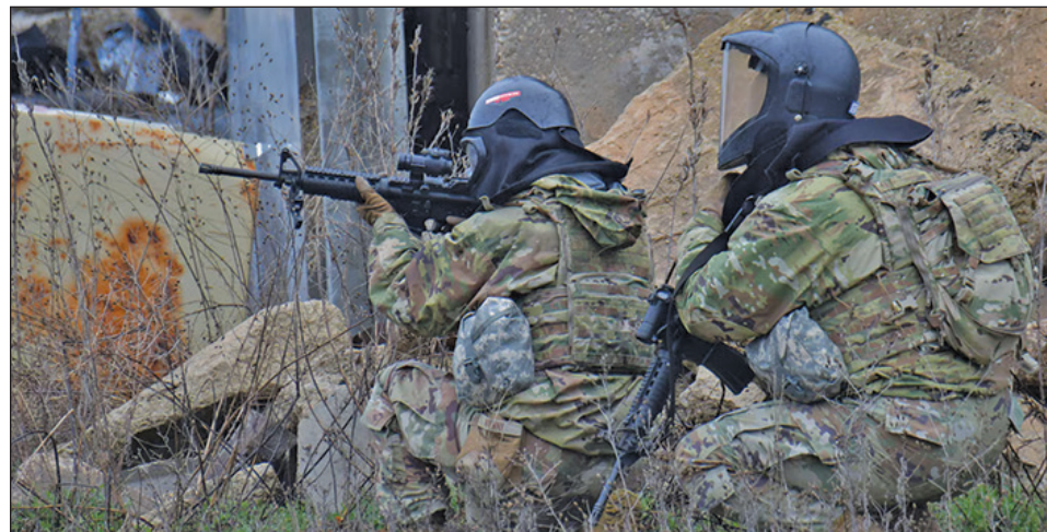
Participating Airmen engaged in a full day of real-world scenarios utilizing simulation rounds.