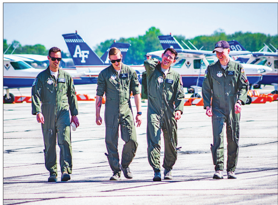
PHOTO COURTESY FULL SPECTRUM PHOTOGRAPHY Rock Valley Publishing Images taken at the 2019 SAFECON at Southern Wisconsin Regional Airport.