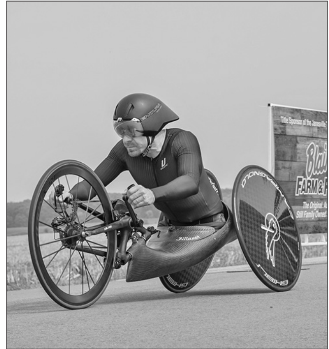
Photo taken at the 2023 U.S. Paralympic Time Trials held in Janesville.