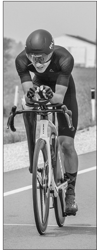
Janesville is gearing up to host the prestigious 2024 Para-Cycling Road National Championships, set to take place from June 11 to June 13.

America's athletes, and is responsible for fielding U.S. teams for the Olympic, Paralympic, Youth Olympic, Pan American and Parapan American Games, and serving as the steward of the Olympic and Paralympic movements in the U.S.