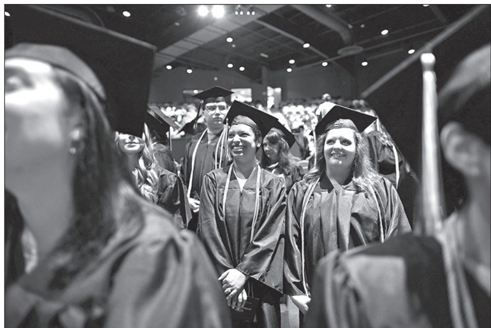
More than 200 graduates celebrated at the Dream Center at Central Christian Church in Beloit.