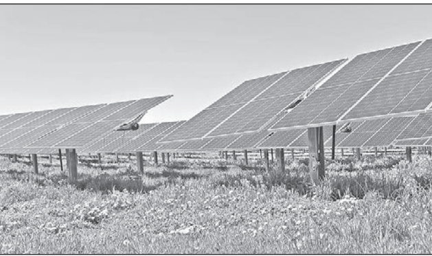
The project’s completion is the culmination of Alliant Energy’s multi-phase buildout of 12 utility-scale solar projects in Wisconsin totaling 1,089 MW.

Through the investments outlined in the company’s Clean Energy Blueprint, Alliant Energy is diversifying its generation portfolio, improving energy security and working to achieve net-zero greenhouse gas emissions from utility operations by 2050.