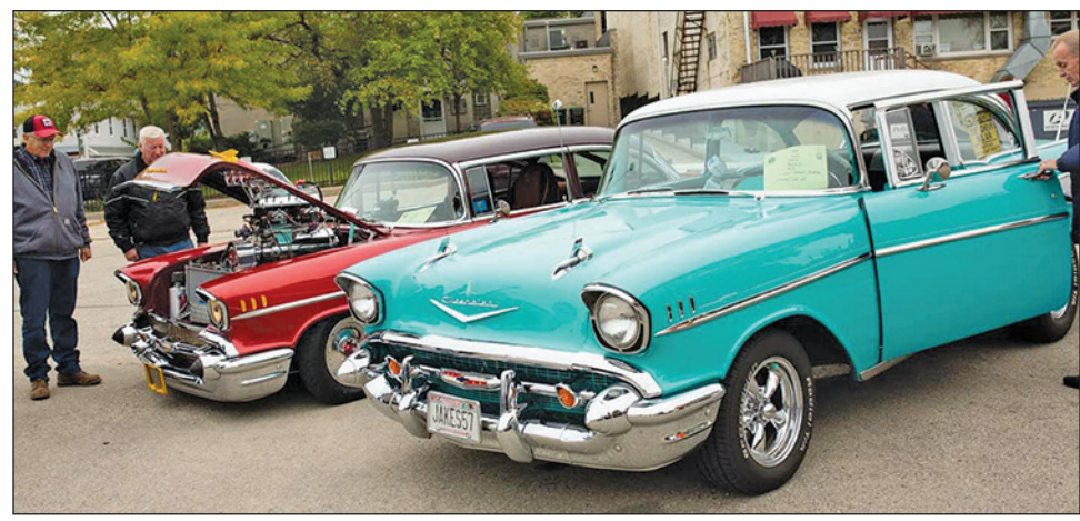
PROPEL FORWARD

Photos with the B-25, Miss Mitchell, and the Dauntless Dive Bomber are also available to pre-registered attendees. Registration can be completed online at pistonsprops.com, or stop in to Traffic James in Clinton, 252 Allen Street, to receive more