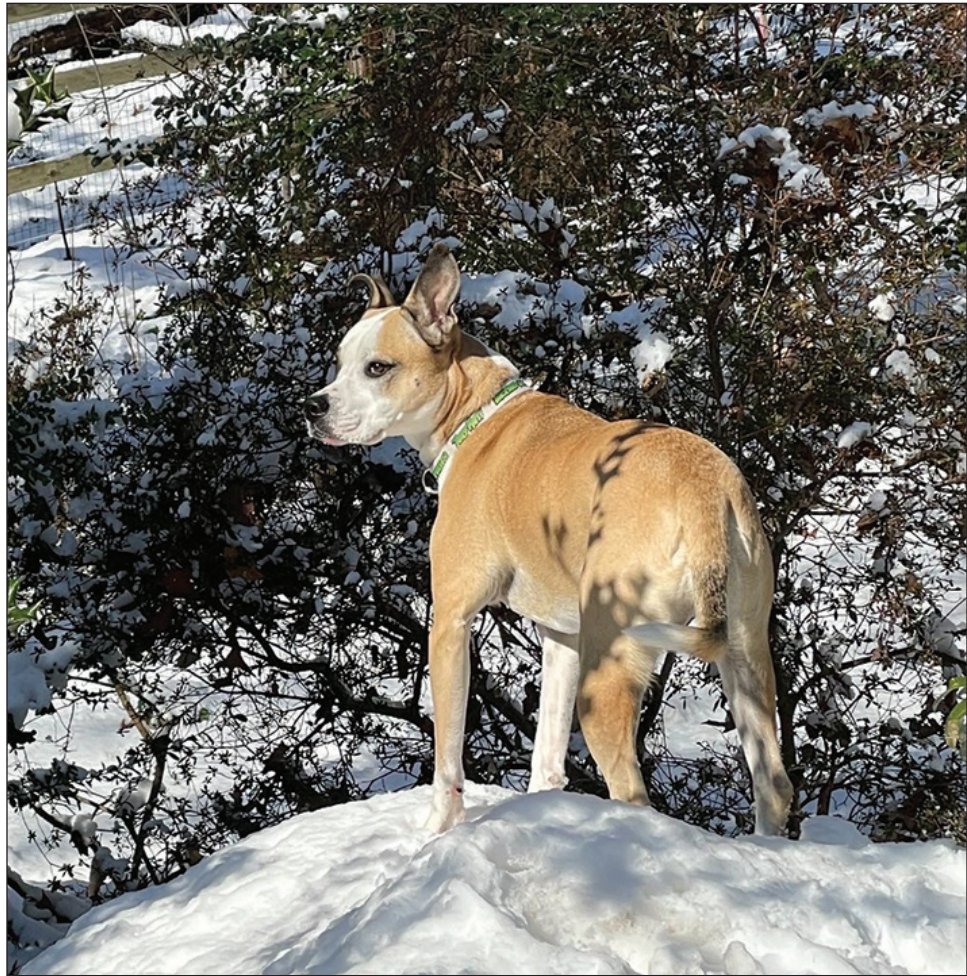
Walking a pet outside increases exposure to natural light – even in the shorter days of winter – and raises levels of serotonin, the body’s “happy chemical.” Sunlight is also a good way to get a natural dose of vitamin D, which is good for bones and the immune system.

TurfMutt, which is celebrating its 15th anniversary in 2024, was created by the Outdoor Power Equipment Institute’s (OPEI) TurfMutt Foundation and has reached more than 70 million children, educators and families since 2009. Championed by Foundation spokesdog, Mulligan the TurfMutt, and through education partners such as Weekly Reader, Discovery Education and Scholastic, TurfMutt has taught students and teachers how to “save the planet, one yard at a time.” Today, TurfMutt is an official USGBC Education Partner and part of their global learning lab. TurfMutt has been an education resource at the U.S. Department of Education’s Green Ribbon Schools, the U.S. Department of Energy, the U.S. Department of Agriculture, the U.S. Environmental Protection Agency, Green Apple, the Center for Green Schools, the Outdoors Alliance for Kids, the National Energy Education Development (NEED) project,