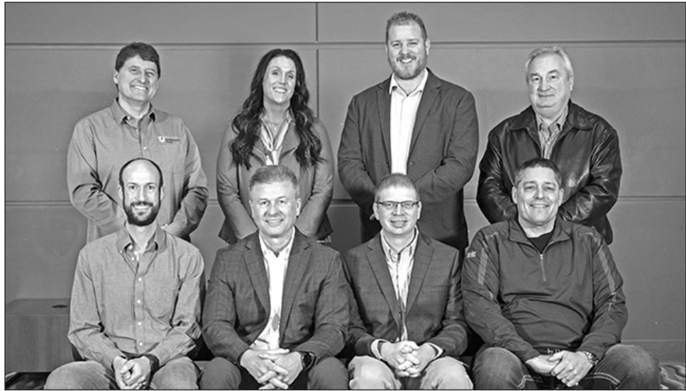
Members of the Dairy Business Association pose for a picture at DBA's Dairy Strong conference on Wednesday, Jan. 15.

The Dairy Business Association is Wisconsin's leading dairy advocacy group, championing smart and sensible regulations affecting the dairy community. The nonprofit organization is comprised of farmers, milk processors, vendors and other business partners who work collaboratively to ensure that dairy farms of all sizes have the support they need to keep America's Dairyland strong. More information: www.dairyforward.com .