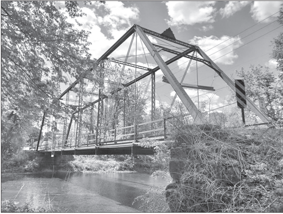
The historic Turtleville Iron Bridge is being offered free of charge for relocation.