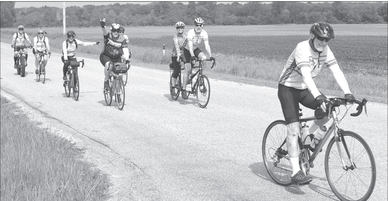
The annual bike ride will feature a tour of the northwestern parks of Rock County this year.